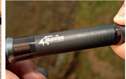
This whipping ensures you will always line up multiple rods evenly on the pod.