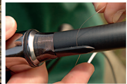
A workmanlike line clip shows that Maver has considered all the details of a quality rod.